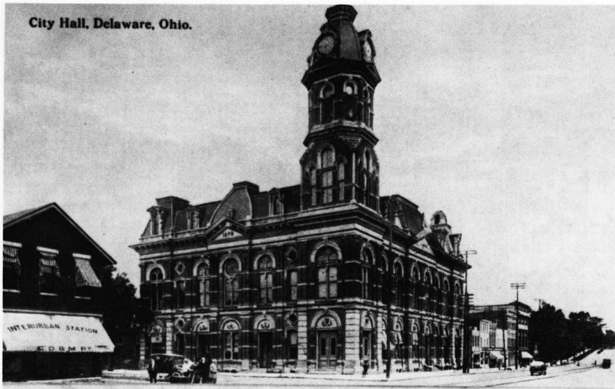
PLATE 58. City Hall - completed in 1882, destroyed by fire in 1934, was also the location of the Opera House, a leading cultural center of the community for many years.